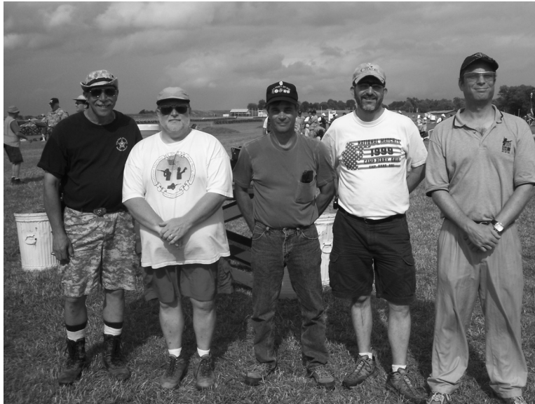
The MSRPA 2008 State Bullseye Pistol Team at Camp Perry.

shoot another 30 shots, finish up by 4:30, then enjoy the rest of your day. So, let's compare... small bore, while I'm not sure how many shots are fired, takes all day to shoot; high power shoots either 30 or 50 rounds and takes eight to twelve hours (no kidding, I've been there for a thirteen-hour NTI match); and pistol fires 90 rounds in two hours, with another 30 rounds for team in another hour or so. If you measure bang for your buck, pistol shooting at Camp Perry is the way to go. Actually, any shooting at Camp Perry is terrific, but there will always be a bit of good-natured ribbing amongst the various