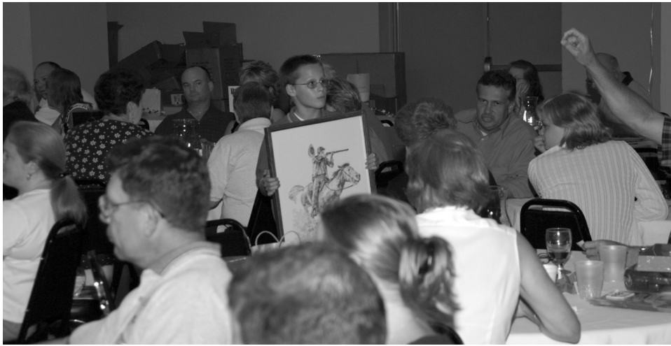
Even the youngsters get in the act helping circulate auction items for closer inspection.