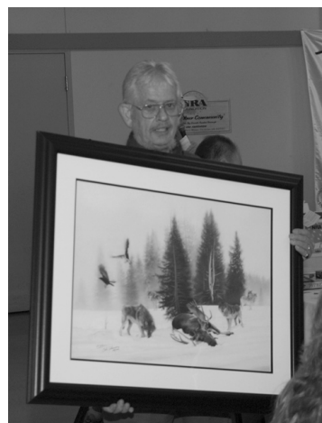
(Left) Committee members keep up interest by circulating auction items throughout the tables of guests.