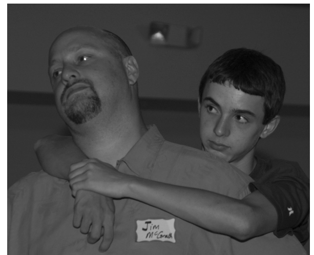
Their expressions say it all!